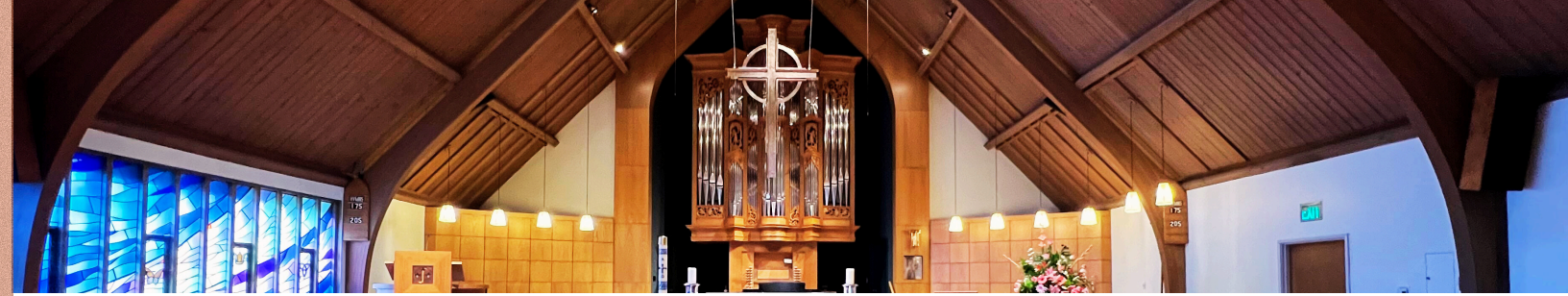
The Rev. Heather Wenrick

As we plan for a new fiscal year to begin in January 2026, your Vestry is drafting a financial budget to support our facilities, worship, ministry and staffing needs. Your pledge allows Ascension to plan wisely and make responsible decisions about the operating budget and funding critical ministries. On average, pledges cover 69% of our operating budget and are a critical component of Ascension's financial sustainability. This year our goals are to engage 80 households and raise $360,000 in pledges . This represents the full amount needed to meet Ascension's operational needs in 2026 without a fundraising event or spring appeal.